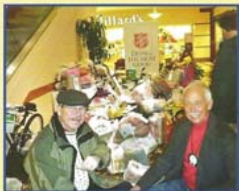
Salvation Army Angel Tree