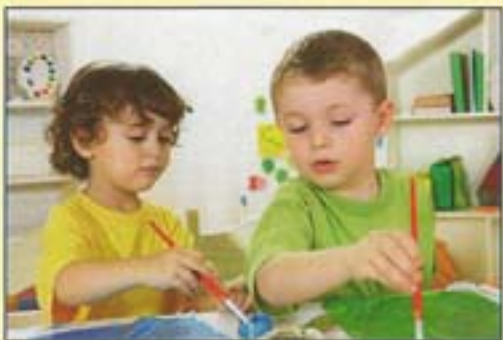
Working with pre-schoolers