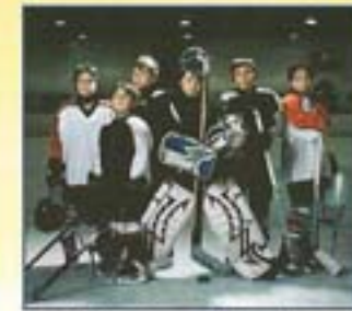
Supports youth hockey