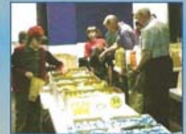
Safety Patrol Kids get a meal