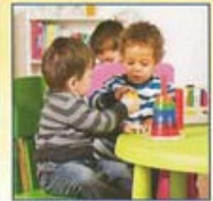
Little Learners at the Huntsville/Madison County Public Library