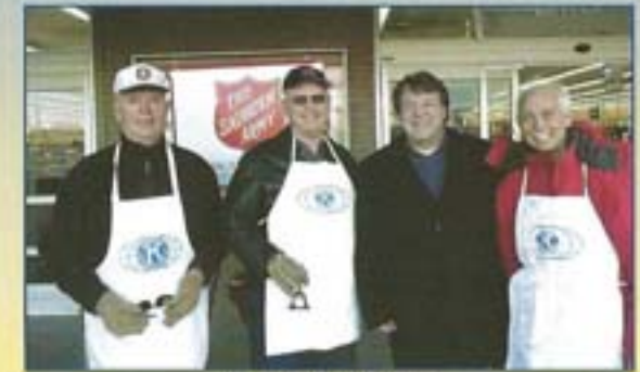
Kiwanis Bell Ringers