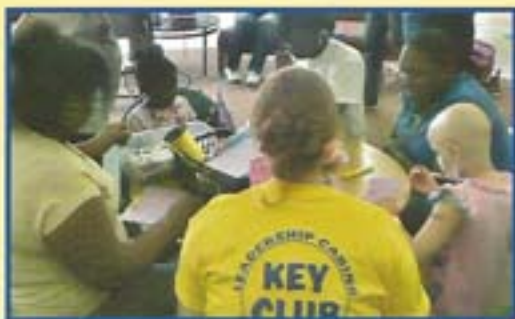
Key Club volunteers helping at Children's Hospital